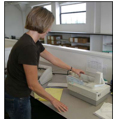
A Canon CR-180 scanner is utilized for imaging checks for the customers are coming to us and asking, ‘How do we sign up?’, not ‘How much is it going to cost?’”