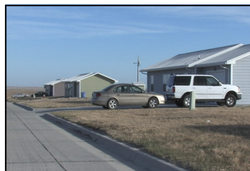
Currently, SWA Corporation manages over 1,200 home units.

FileDirector® is a modular system that allows a company to effectively tailor its own solution as document management needs grow. With FileDirector®, SWA Corporation is confident its document management system will fully adapt to meet future requirements. Said Prue, "We have eight departments, and now that we have nearly completed the document imaging for our Occupancy area, our plan is that eventually all of our departments would transition into document imaging."