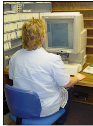
Secretary of State Office utilizes Canon MS-400 & 800s for scanning microfilm.